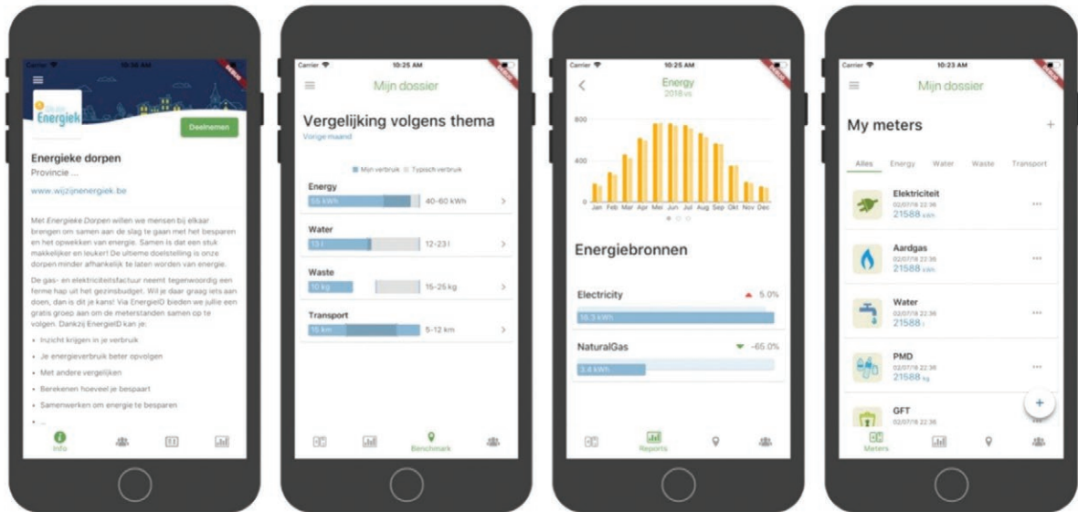
Figure 3 Initial screenshots of the app

On the front-desk, activities with citizens and community engagement: