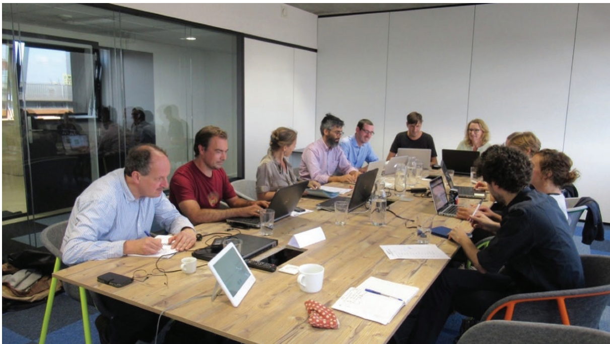
Picture 5 meeting with the project partners on 20 September 2018