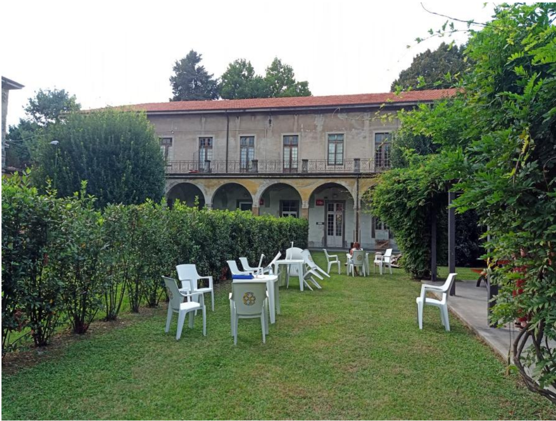
The hospital pavilion before being redeveloped.