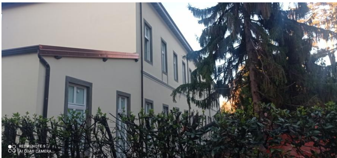
Detail of the co-housing pavilion after the building renovation process

In its undertaking to establish innovative and practical co-housing adapted to the needs of the target group, CAPACITYES encountered and successfully addressed several challenges. These experiences serve as valuable lessons and considerations for future attempts, pointing out the importance of adaptability, community engagement, transparent decision-making processes, and design approaches unafraid to experiment with innovation. The project's success thus far establishes a precedent for inclusive, community-driven urban development initiatives, with a specific focus on co-housing as a solution to housing and structural poverty, particularly for new migrant families .