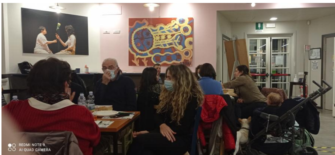
A participative moment for CAPACITYES projects in the transition period to post-COVID