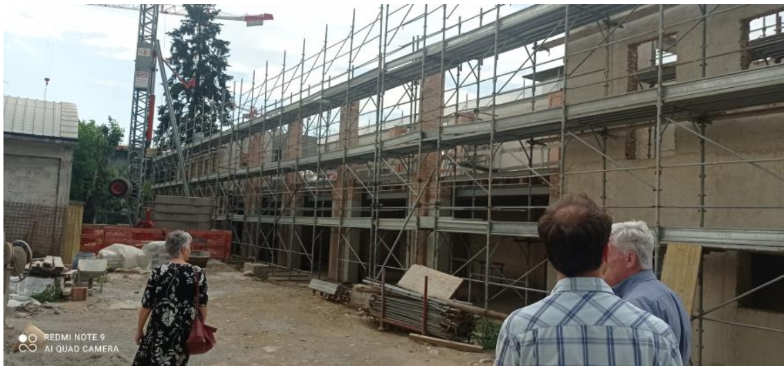
The HUB4KIDS construction site at the time when material were not available and prices where undergoing an inflationary process

virtue. Having to move events to other unplanned locations unexpectedly facilitated outreach, generating increased interest from other local actors in the project. This, in turn, triggered synergies that now contribute constructively to the use of HUB4KIDS.