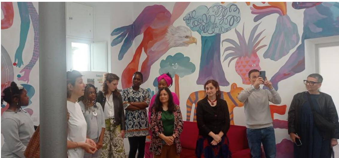
Inauguration party for cohousing spaces (former abandoned hospital pavillon), May 2023

The following chapter will focus on the lessons learned, emphasizing that the journey from neglect to collaborative living is not just a physical transformation but a recognition of Bergamo's unwavering dedication to building a sustainable, inclusive, and empowered communities.