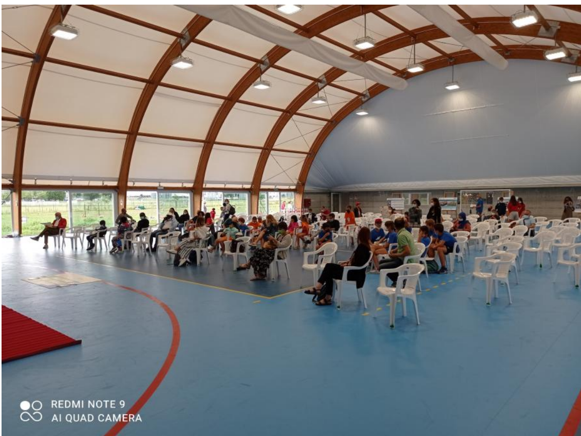
CAPACITyES project communication event to schools, children involved and local stakeholders

These installations serve a dual purpose: to artistically mark the regeneration journey undertaken and to enhance the involvement of children and teenagers in shaping future choices for this neighborhood in Bergamo through participatory moments based on creative workshops .