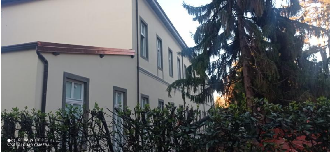
Detail of the co-housing pavilion after the building renovation process

In its undertaking to establish innovative and practical co-housing adapted to the needs of the target group, CAPACITYES encountered and successfully addressed several challenges. These experiences serve as valuable lessons and considerations for future attempts, pointing out the importance of adaptability, community engagement, transparent decision-making processes, and design approaches unafraid to experiment with innovation. The project's success thus far establishes a precedent for inclusive, community-driven urban development initiatives, with a specific focus on co-housing as a solution to housing and structural poverty, particularly for new migrant families .