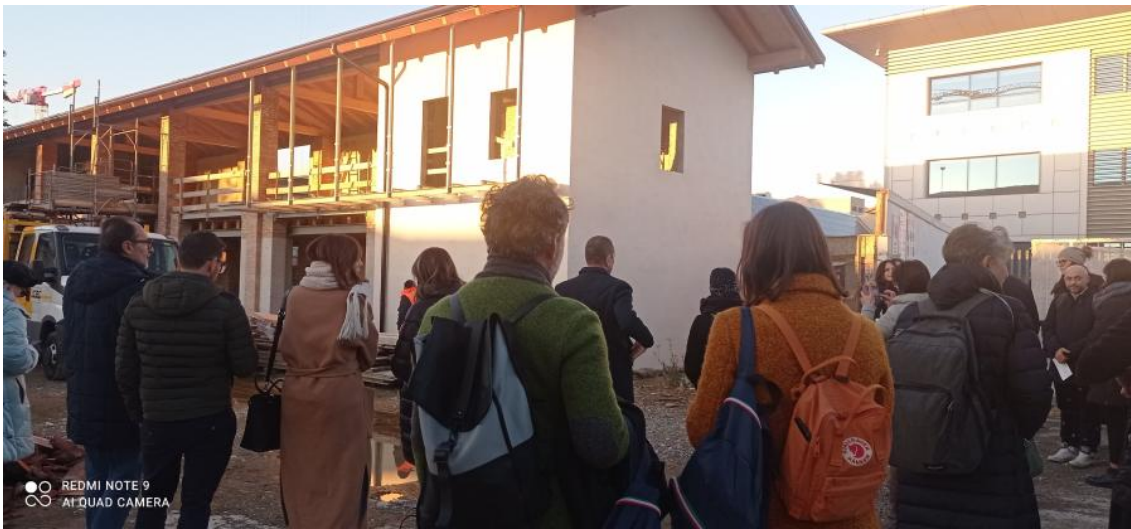
The Hub 4 Kids a few days before its inauguration, you can see the completely redeveloped farmhouse.