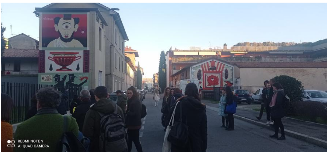
Representative of Italian municipalities visiting the murals corridor connecting the CAPACITYES regeneration area

In order to better understand the regenerative process underway in the neighbourhood, the representatives of the host cities were led to observe the murals of the Odyssey which unite and define the intervention areas in the neighbourhood. This artistic project had a very positive effect and, in response to the questions received, the project partners explained the meaning of this choice, in particular and remembered how the choice of this ancient and classical story, rooted in European and Mediterranean culture, has facilitated the involvement of children in the participatory process , moreover, it has constituted a symbolic reference story for current migrants: the Mediterranean is still a place of migration, mutual meeting, but often also a place of tragedies, as in the Odyssey.