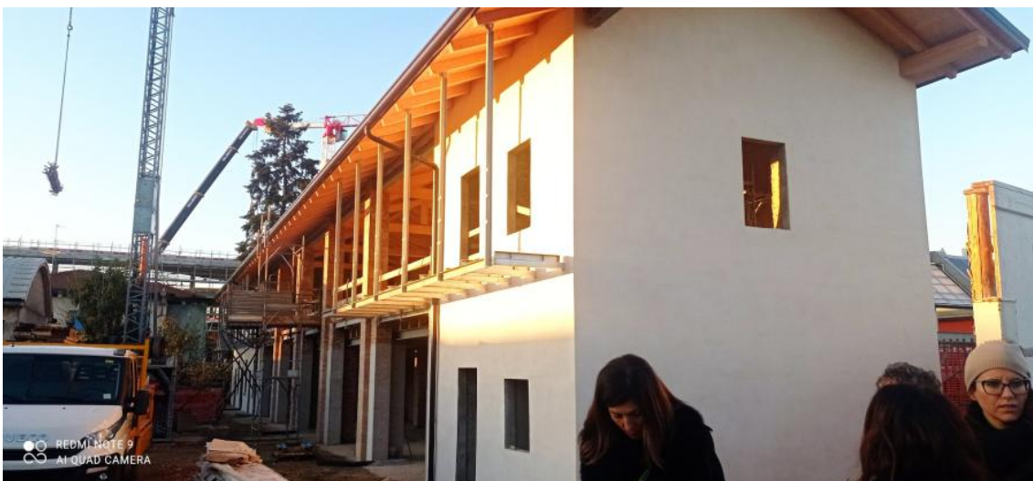
The Hub4Kids building site, refurbishment work in progress, Bergamo, Via Serassi.

After the project visit, all the excursion participants met in a final workshop to discuss together their impressions about the CAPACITYES PROJECT. All levels of governance were present for the discussion, from representatives of the Ministry of Infrastructure and Transport, responsible for the mainstreaming of national operational programmes, to some regional managers, with responsibility for the mainstreaming of regionally managed structural funds (a key level for territorial governance) and many municipal managers interested in developing similar experiences. The municipal managers were very interested to understanding how to organize themselves to propose and design competitive and innovative proposals for the new EUI calls. The discussion was moderated by the leaders of the CAPACITYES project, together with the representatives of ANCI and the UIA expert (the author of this article). The debate focused on key points: