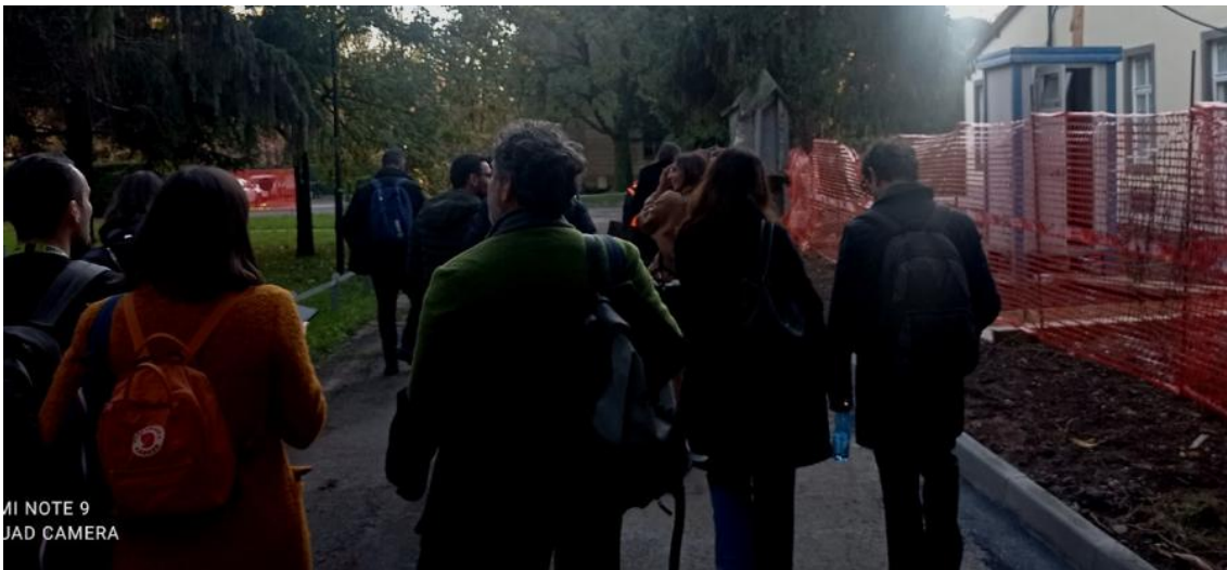
Representative of Italian municipalities visiting the building site in Borgo Palazzo, place of the co-housing experience, former hospital