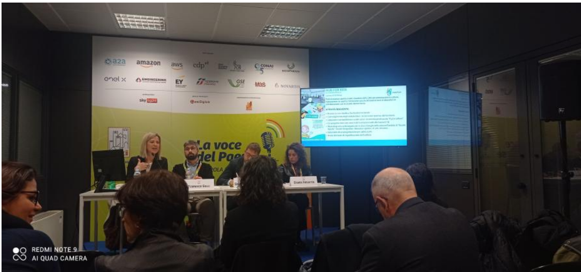
ANCI Event, UIA, EUI meeting, focus on CAPACITyES AND ToNite results.