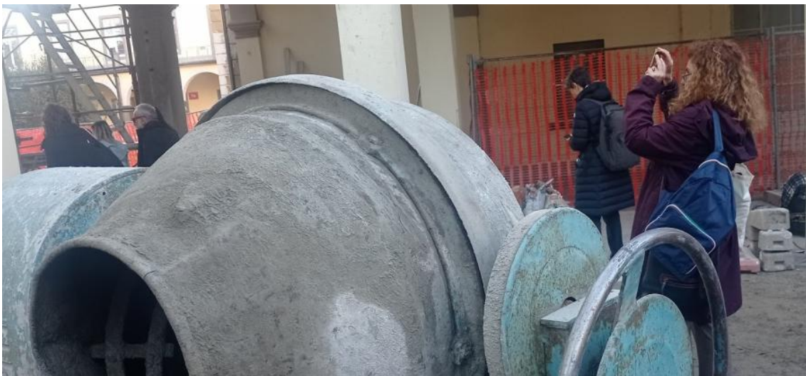
Representative of Italian municipalities visiting the building site in Borgo Palazzo, place of the co-housing experience, former hospital

In order to better understand the regenerative process underway in the neighbourhood, the representatives of the host cities were led to observe the murals of the Odyssey which unite and define the intervention areas in the neighbourhood. This artistic project had a very positive effect and, in response to the questions received, the project partners explained the meaning of this choice, in particular and remembered how the choice of this ancient and classical story, rooted in European and Mediterranean culture, has facilitated the involvement of children in the participatory process , moreover, it has constituted a symbolic reference story for current migrants: the Mediterranean is still a place of migration, mutual meeting, but often also a place of tragedies, as in the Odyssey.