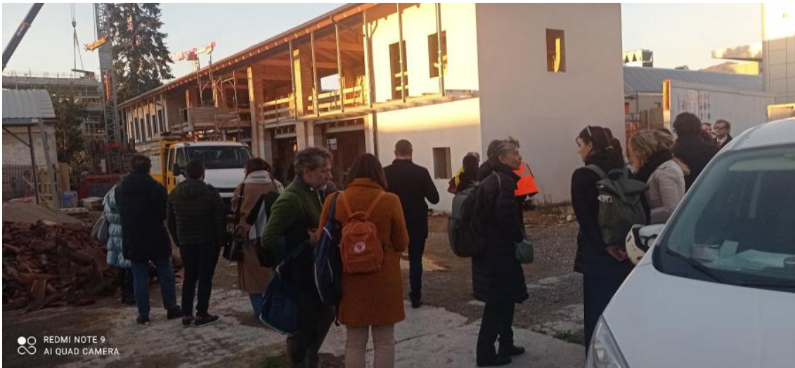
Representative of Italian municipalities visiting the building site of the Hub4Kids in Via Serassi