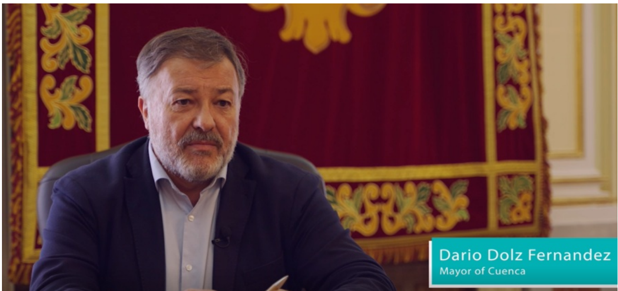
Dario Dolz Fernandez Mayor of Cuenca