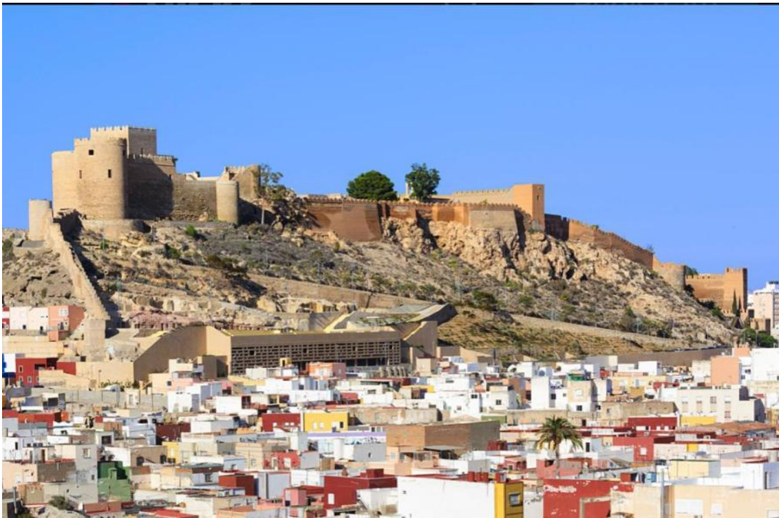
Mesón Gitano in the Almería Landscape