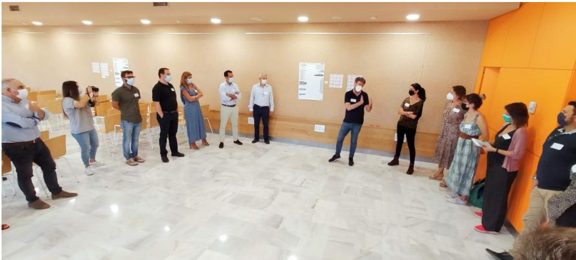
Cultural Storytelling workshop

A “Cultural Landscape Storytelling Group” of Almeria was set up, composed by all the storytellers, both experts and common people. The “Cultural Landscape Storytelling Group”, facilitated by Khora project partner, have been meeting regularly to share the stories and co-create the Novel Collective Narrative of Almería’s Cultural Landscape.