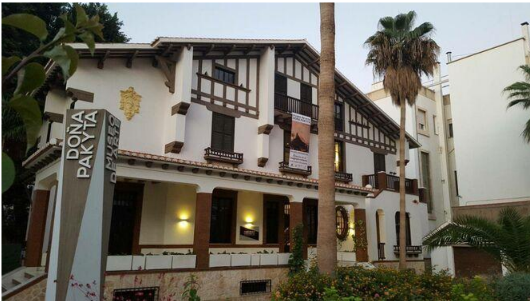
Doña Pakyta Museum