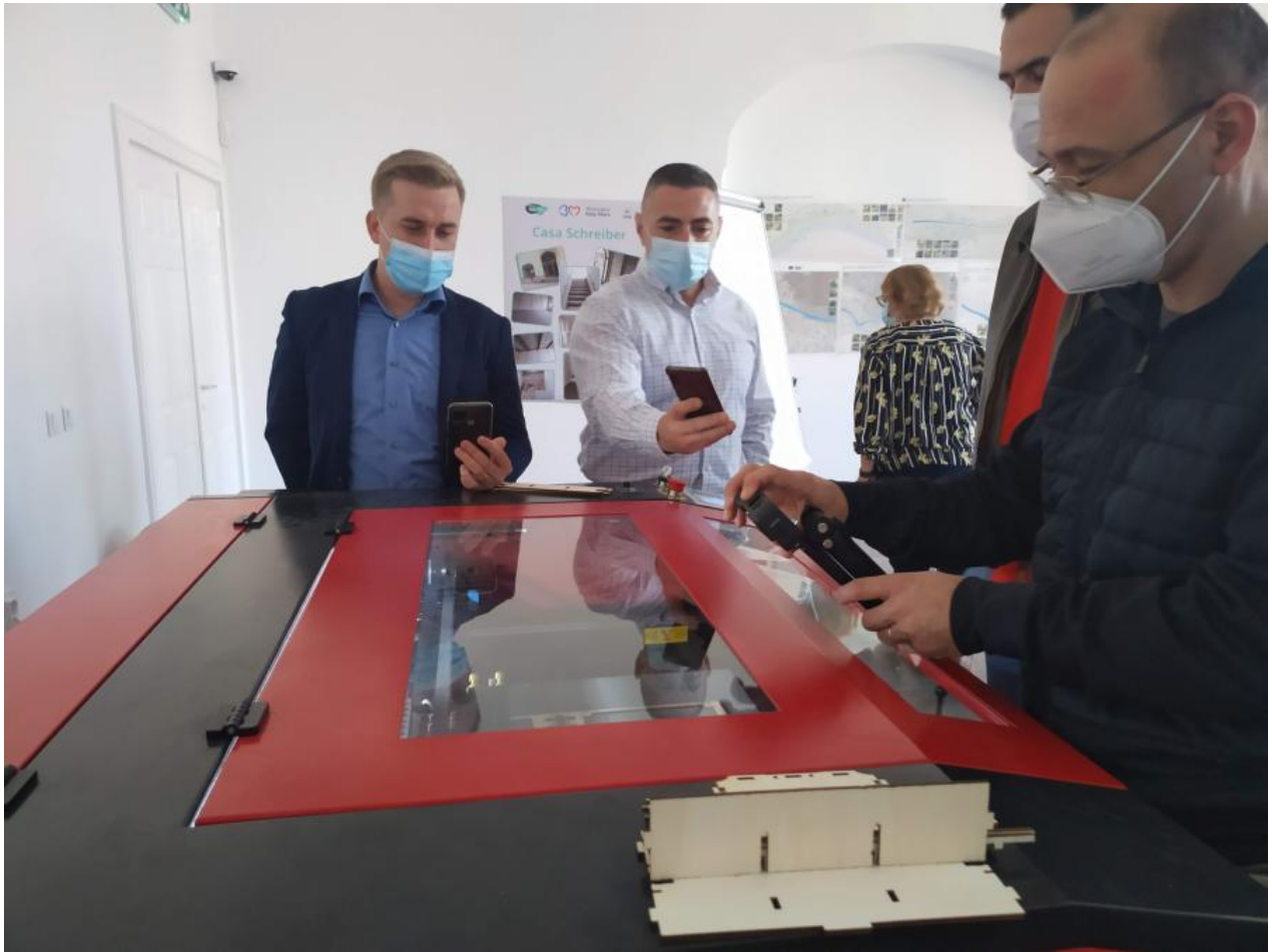
Fig 5. Maker space demonstration in the renovated casa Schreiber.

related to the SPIRE project, maker space demonstrations for 3D printers and laser cutting machines, and the first workshop on the iLEU platform and wallet.