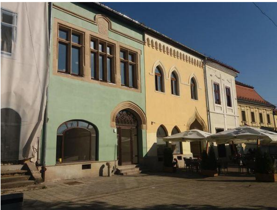
Fig. 4. SPIRE Hub in casa Schreiber.

On 28th October, the launch of the SPIRE HUB took place, with the participation of the entire SPIRE consortium. The building has already been partially renovated, and it is ready to be used as SPIRE Hub and Makerspace. A further extension has been granted to renovate the attic and the remaining ground floor room to support the iLEU activities.