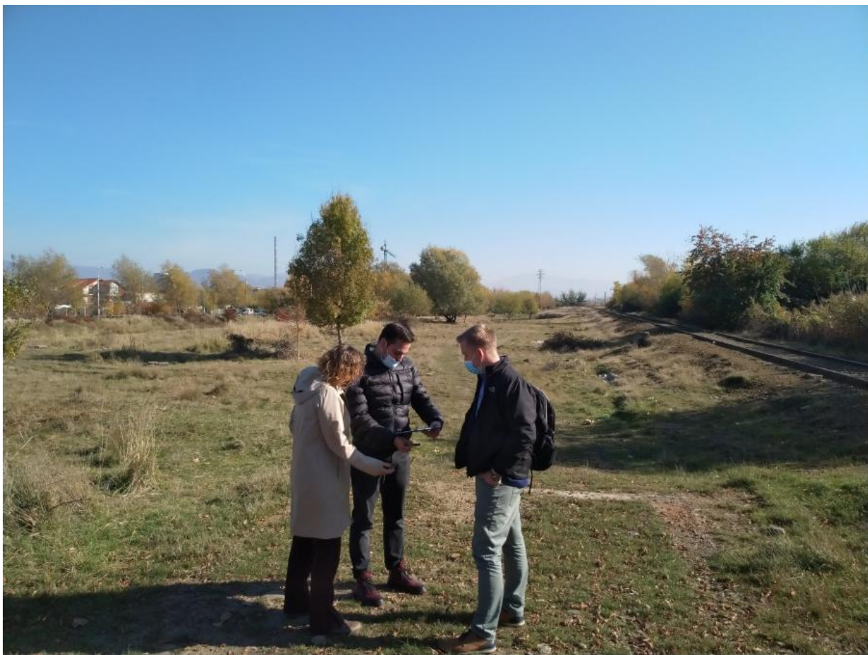
Fig 2. Visit to the pilot sites to assess plantations (October 2021).

Some Plantathlons activities carried out in the city during spring 2021 created a collaborative ecosystem supporting citizen led actions and enhancing the community's involvement in the preparation, seeding, and planting for each of the pilot sites (Romplumb, Ferneziu, Colonia Topitorilor, Urbis, and Craica).