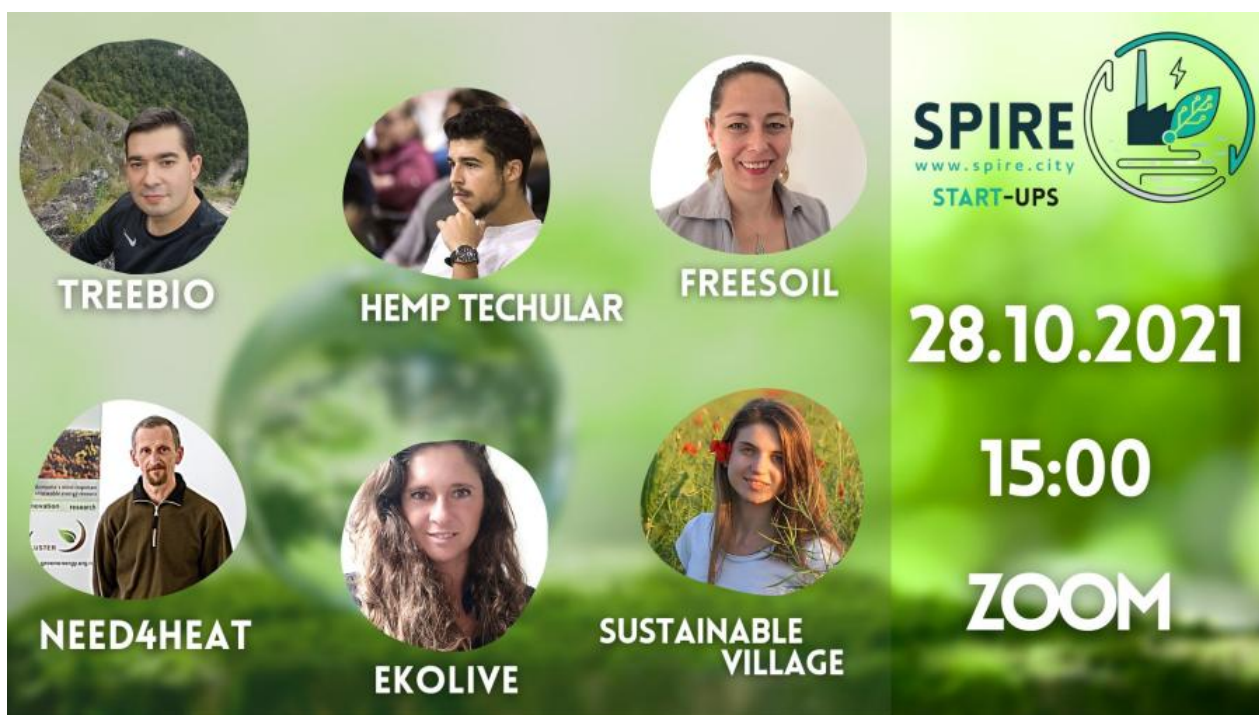
Fig 7. SPIRE Start-ups DEMO DAY event.

Different ideas around the biomass value-chain were assessed and validated during various workshops, thematic webinars, and individual mentoring sessions held during the first stage of the programme performance by a team of specialists. The six preliminary selected participants were given the chance to present their ideas during the SPIRE Start-ups DEMO DAY event. Three of them were chosen to continue to the second stage of the mentoring process: the first stage focused on improving the Business Model; the second stage will focus on scaling-up potentialities. The 3 best startups, chosen by a jury and the local community, will be able to use the facilities of SPIRE HUB & MAKERSPACE.