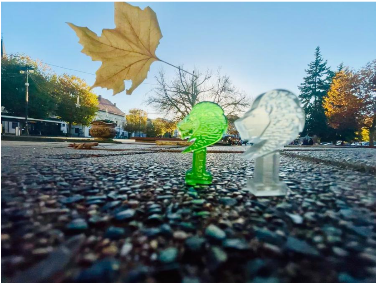
Figure 8. iLEUS figures produced by 3D machine in the maker space.