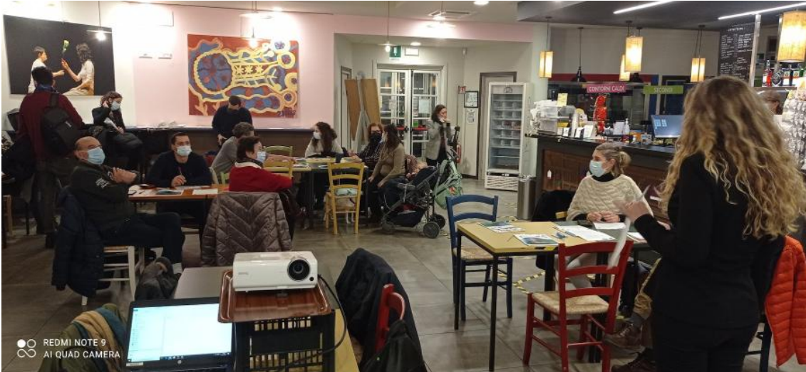
Participatory evaluation meetings, discussing with the neighbourhoods' stakeholders the proposed solutions (Borgo Palazzo II)

Dialogue and participation are at the foundation of: