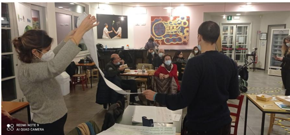
Participatory evaluation meetings, discussing with the neighbourhoods' stakeholders the proposed solutions (Borgo Palazzo I)

How do you evaluate the temporary cohousing proposed by the CAPACITYES project, as a solution aimed at favouring housing autonomy for families in difficulty?